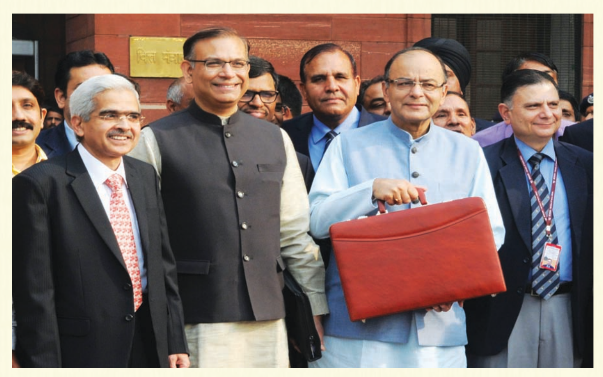
Finance Minister Shri Arun Jaitley on his way to present Budget 2016-17.